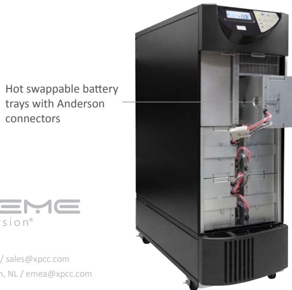
TX90-10K front view (panel removed)

For extended runtimes and detailed requirements, see www.xpcc.com/selector . Runtimes are shown in minutes and will vary based on battery condition, age, cycles, and ambient temperature. Optional 1000W charger recommended for applications requiring three or more battery packs.