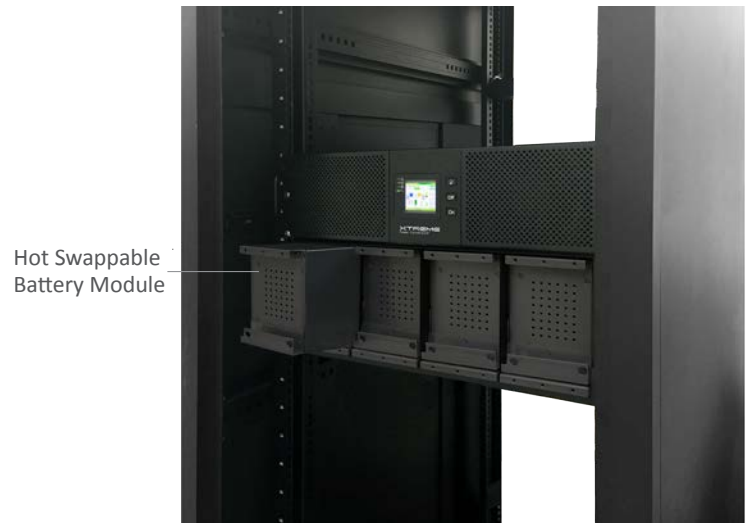
R91 UPS and BP-XR4U480A battery. Front battery panel removed