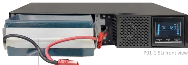
Hot swappable battery tray

Runtimes are shown in minutes and will vary based on battery condition, age, cycles, and ambient temperature.