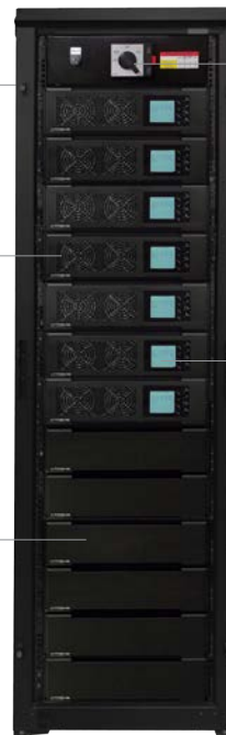
M90S-42k 42kVA/42kW with 8 minute battery in 42U rack

Battery Module includes 16 pieces of 12V 580W batteries