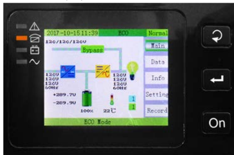
Color LCD display

Runtimes are shown in minutes and will vary based on battery age and site conditions. Extended battery pack runtimes are based on E90 units with three internal battery strings.