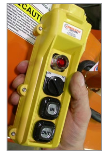
REMOTE PUSH BUTTON PENDANT