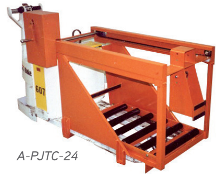
Pictured With A Drive Under Base Option