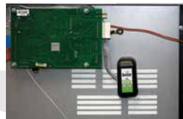
Detail View of CID

The No-Gassing feature of the 2 Circuit Eclipse II Plus allows a programmable time to be set so that should the charger reach the gassing portion of the charge cycle within the set time, the charger would stop charging until the set time has elapsed. Only at this point would the charger continue to charge and take the battery to charge complete.